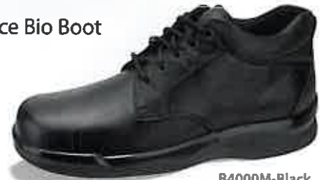
Lace Bio Boot